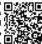
Table & Chairs Rental:

Scan this code with your phone's camera to sign up for our digital bulletin and parish notifications by entering your cell phone number and email and then joining the "Weekly Bulletin" group along with any other groups that you would like to be a part of.