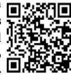
Table & Chairs Rental:

Scan this code with your phone's camera to sign up for our digital bulletin and parish notifications by entering your cell phone number and email and then joining the "Weekly Bulletin" group along with any other groups that you would like to be a part of.