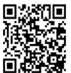
Table & Chairs Rental:

Scan this code with your phone's camera to sign up for our digital bulletin and parish notifications by entering your cell phone number and email and then joining the "Weekly Bulletin" group along with any other groups that you would like to be a part of.