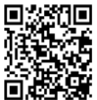
Table & Chairs Rental:

Scan this code with your phone's camera to sign up for our digital bulletin and parish notifications by entering your cell phone number and email and then joining the "Weekly Bulletin" group along with any other groups that you would like to be a part of.